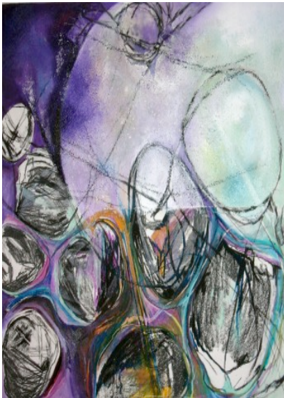
Miriam Laville, Mixed Media on canvas